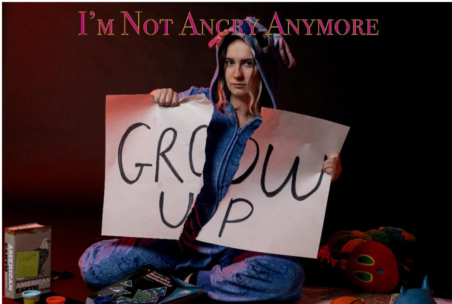
Examples of photos entered into the Creative Photography for 2024 NH Congressional Art Contest: